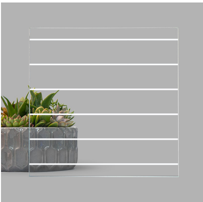
Bird Safe Frit | Horizontal Lines

The 2x4 rule describes the distance between elements making up a pattern applied to windows for the purpose of preventing bird strikes. To be effective, the pattern must uniformly cover the entire window and consist of elements of any shape (lines, dots, other geometric figures, etc.) separated by no more than 5 cm (2 inches) if oriented in horizontal rows, or by 10 cm (4 inches) if oriented in vertical columns. These patterns reduce bird-glass railing collisions when applied to the outer surface (Surface #1) of reflective panes. Greater spacing between pattern elements increases the risk of a strike and casualties. GlasPro Bird Safe Fritted glass has a five-year warranty.