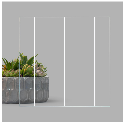
Bird Safe Frit | Vertical Lines